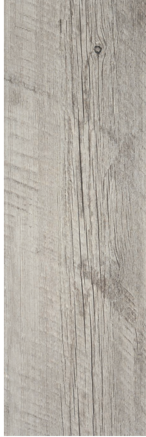
CENERO 20.5 x 61.5 cm (8.07" x 24.22") Matte Finish UN.SM.CNR.0824.MT