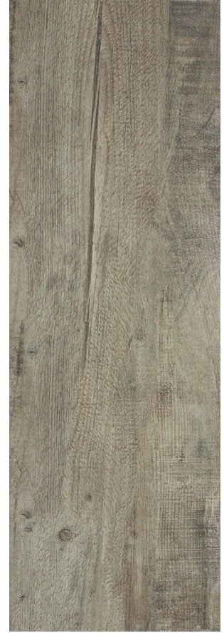
WALNUT 20.5 x 61.5 cm (8.07" x 24.22") Matte Finish UN.SM.WAL.0824.MT

All items shown in this document are part of Olympia's stocking program. For special orders, please contact your Olympia Tile Sales Representative.