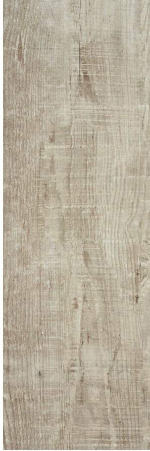
SAND 20.5 x 61.5 cm (8.07" x 24.22") Matte Finish UN.SM.SND.0824.MT