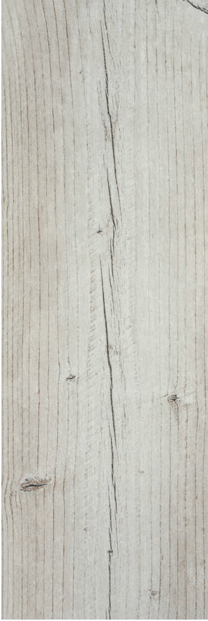
ASH 20.5 x 61.5 cm (8.07" x 24.22") Matte Finish UN.SM.ASH.0824.MT